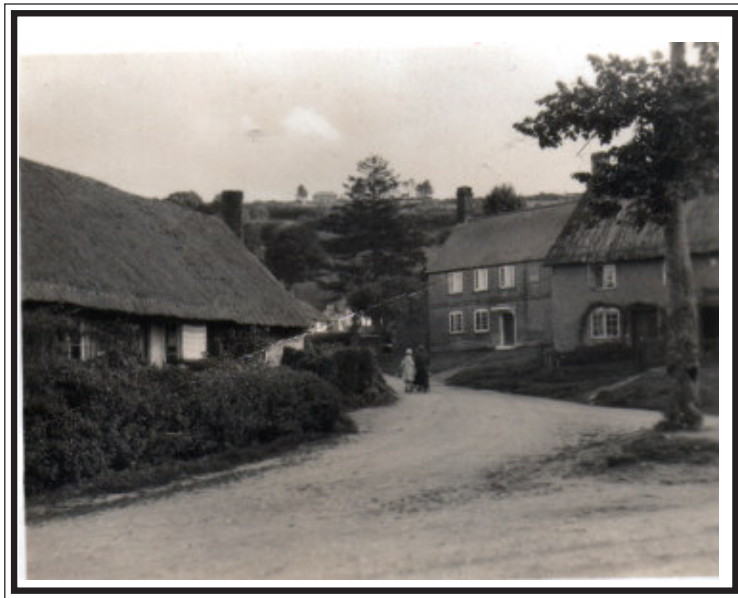
View from the Cross to The Crown Inn in the early 1900's

It is hoped that the following contributions will present a picture of our village and the lifestyle of its inhabitants as we enter a new Millennium.