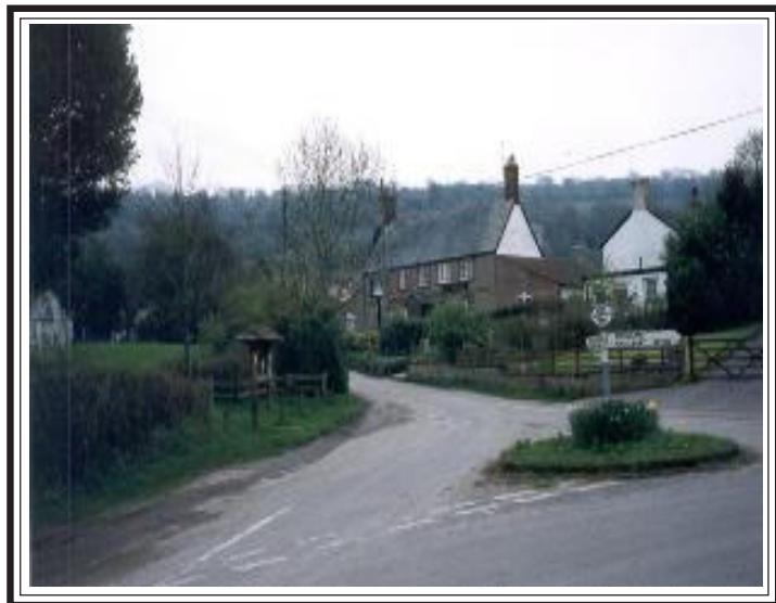
The Cross in 2001